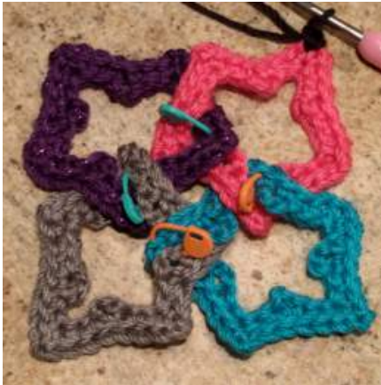
Joining the yarn

Using the foundation chain yarn, join to the foundation chain of the first sc made. Weave in ends.