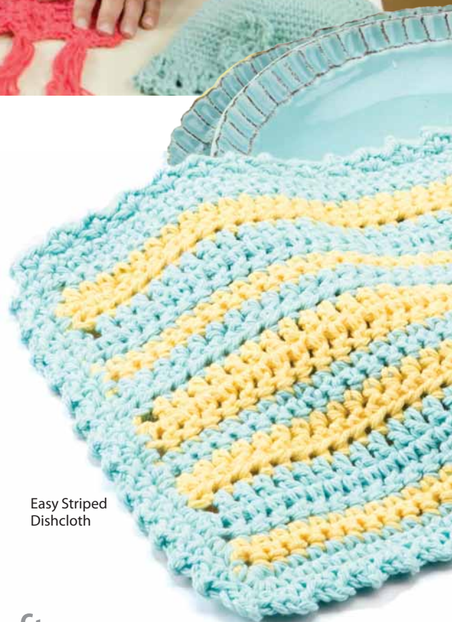
Easy Striped Dishcloth

exclusive crochet projects included as part of the class curriculum